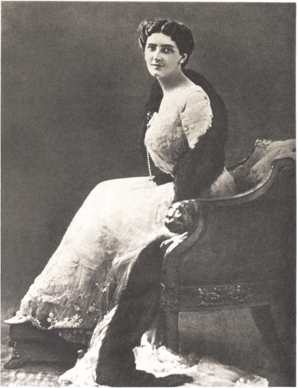
The late Lady Curzon.