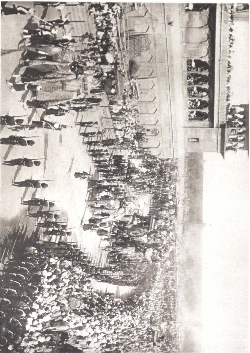
(The King & Lady Empress)